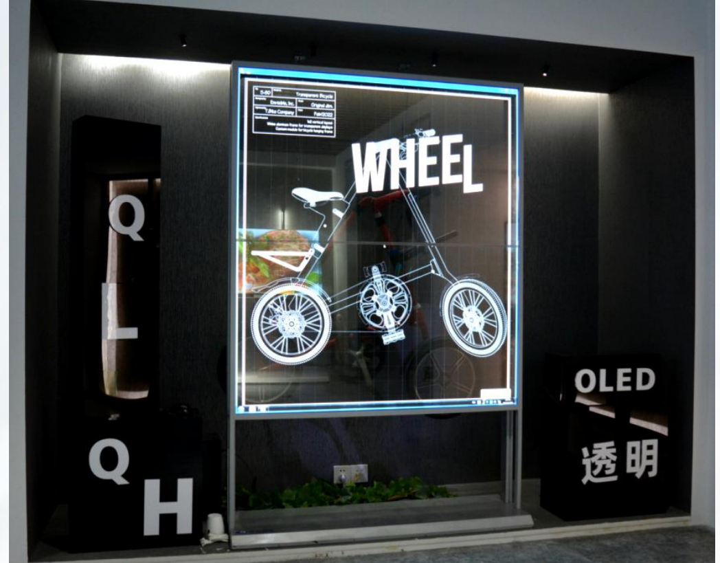
● 110-inch OLED display - bicycle display