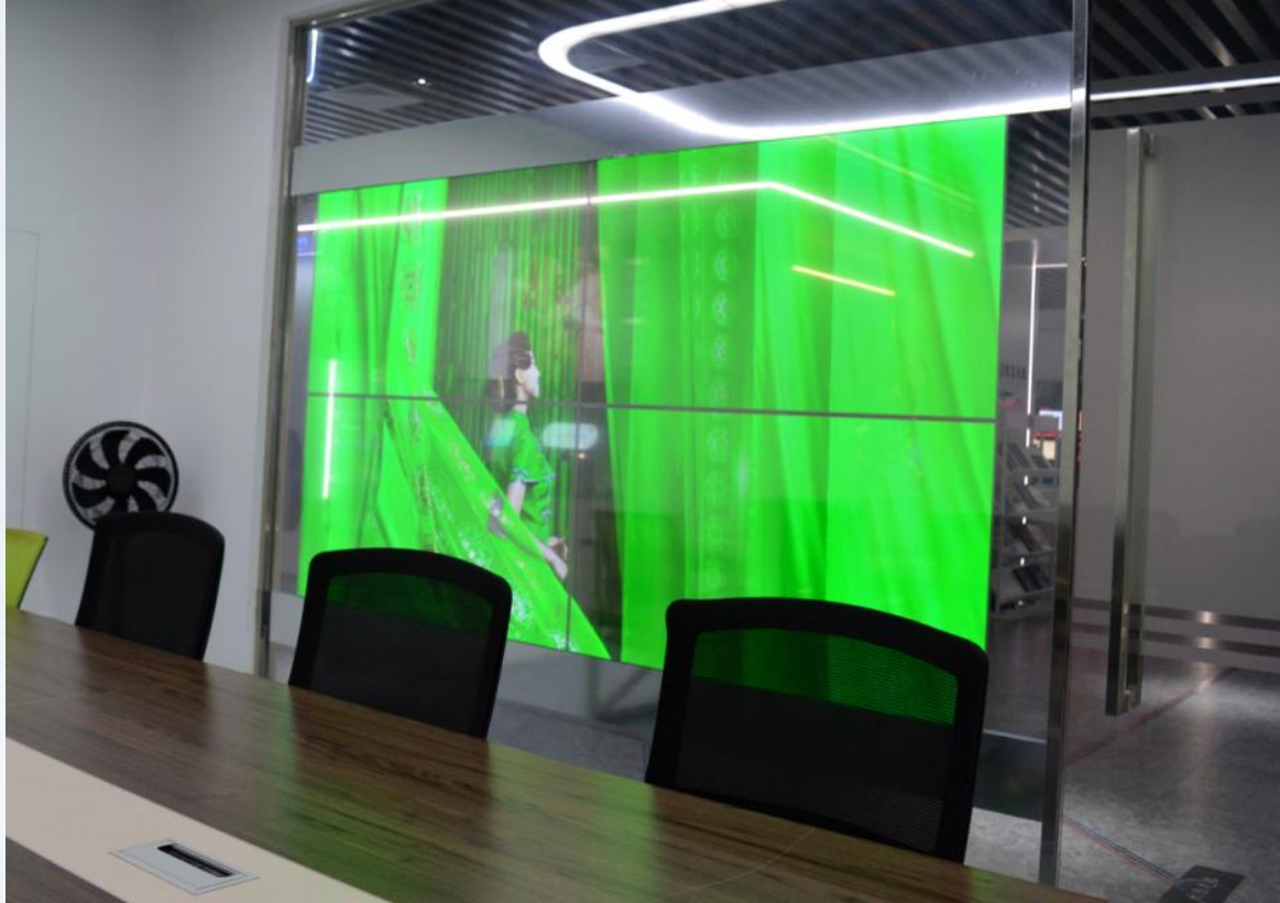
● Large-size OLED splicing screen-conference room