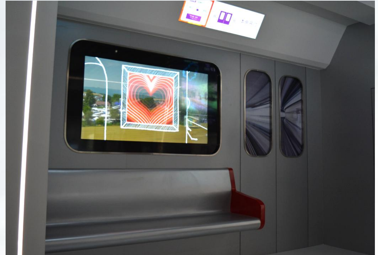
● 55-inch large-size transparent OLED display - subway