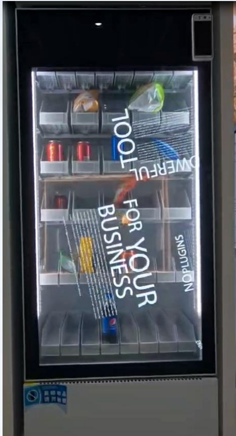
● 55-inch OLED display - Refrigerator