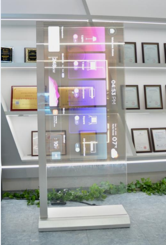
● 30-inch OLED display - coffee shop