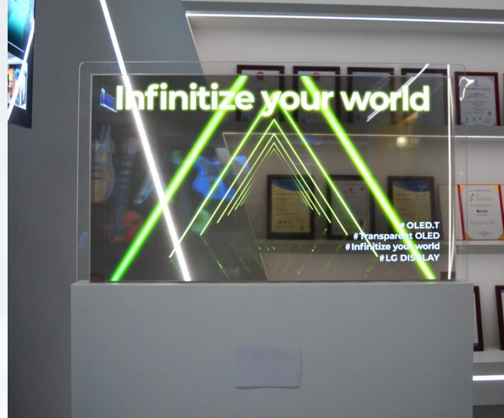
● 55-inch OLED transparent screen