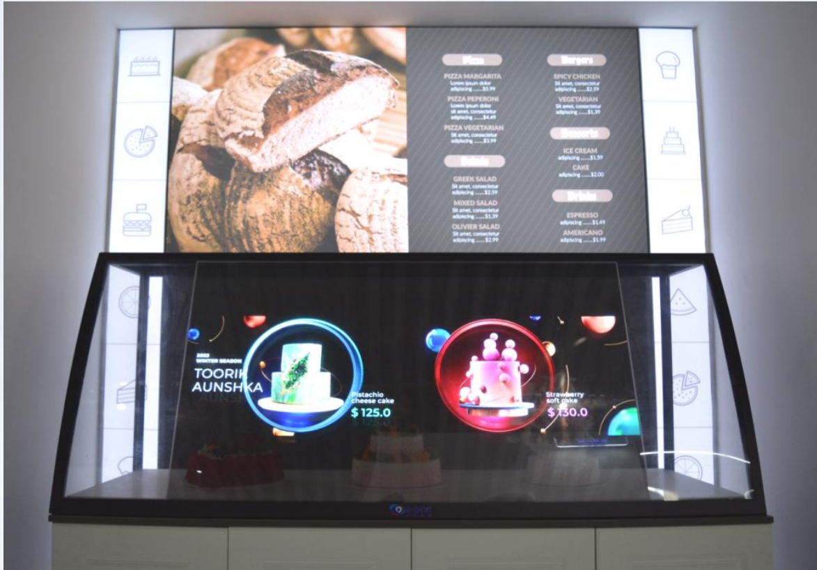
● 55-inch large-size transparent OLED display- cake house