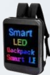
LED Fifth-generation full-color frosted bag