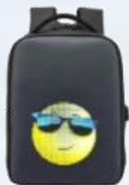
LED Fifth-generation full-color frosted bag