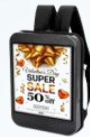
LED HD display Bluetooth audio