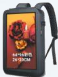
LED HD Bluetooth speaker large size