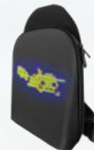
LED Full-color satchel