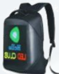
LED The third generation mill Sand backpack